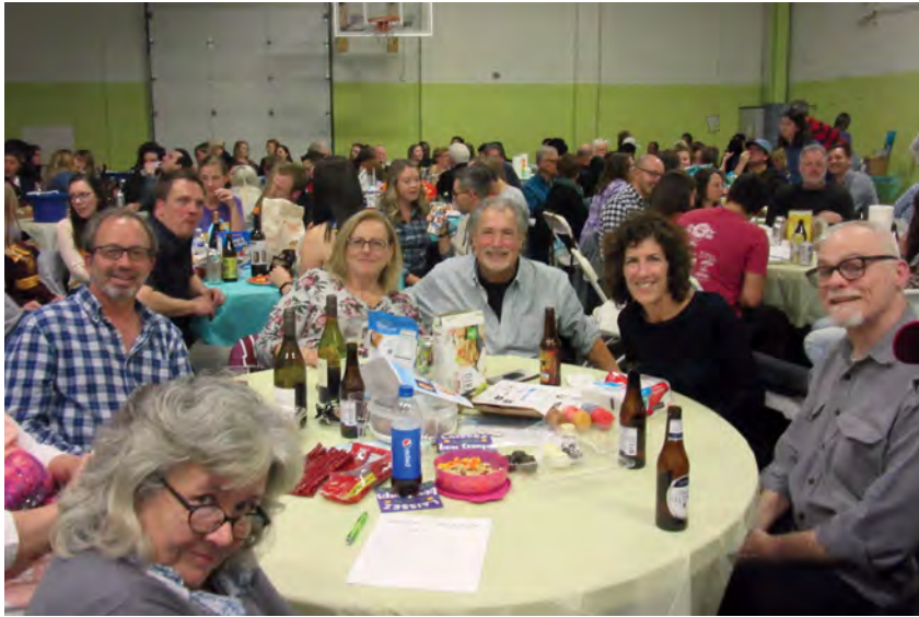
2018 Rise YP Trivia night

Total investment since 1993 in Rise-assisted community development projects: $707,013,500