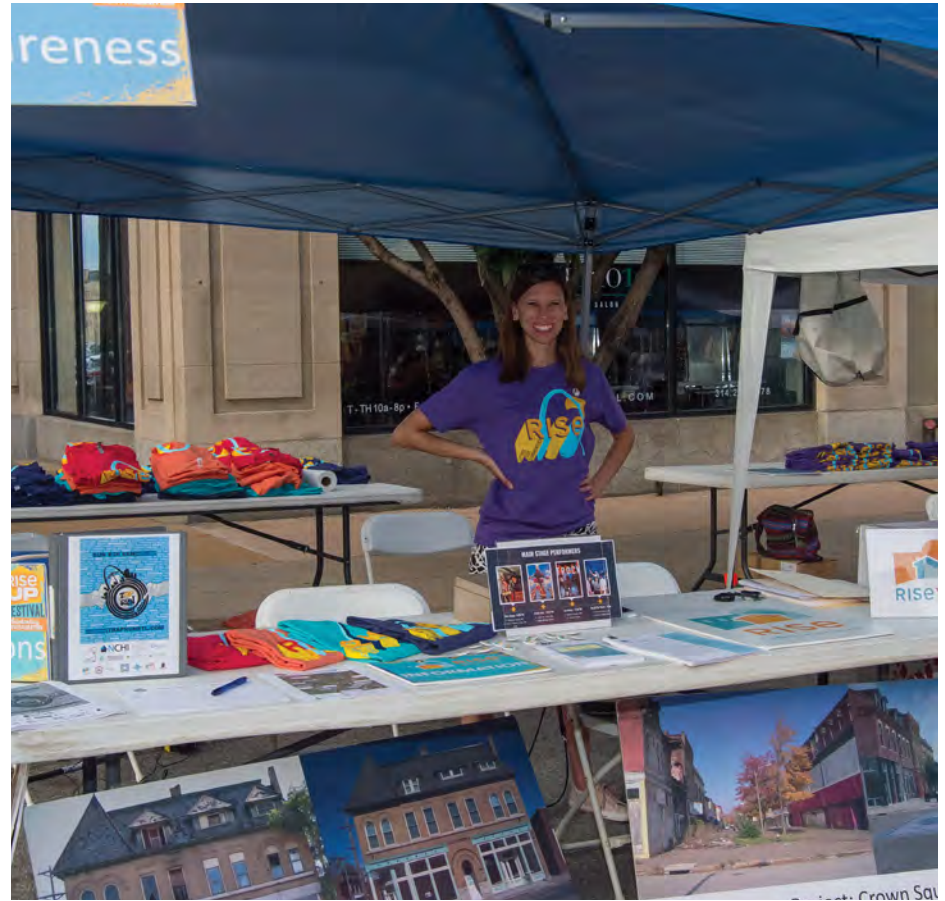
Rise YPs hosting the Rise Awareness booth at the 2018 Rise Up Festival.

In 2019, the Rise YPs will be working with Rise's community development technical assistance department to provide a lift to organizations supported through our work with Invest STL. In addition to this work in the community, the Rise YPs host social events designed to engage other young professionals and provide professional development opportunities; and continue to host their annual fundraisers: the Rise YP Trivia Night and their annual pub crawl.